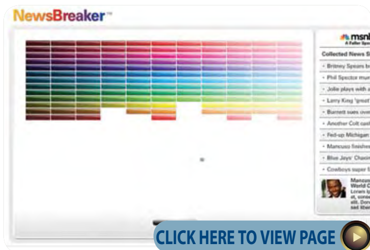
NewsBreaker provides an entertaining way to consume the news.