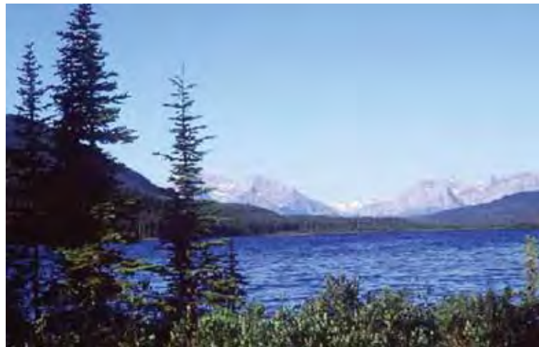
Top photo: English Bay, Vancouver Inset: Rock Lake, Alberta