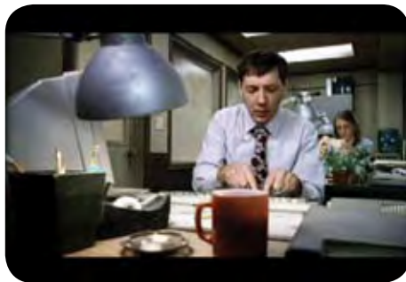
Worker gets airlift relief from a dead-end job.