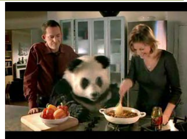
Click Poster To View "Adopted"