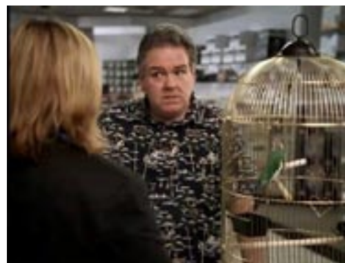
Click Poster To View "Returns"

Nonetheless, the tenor of the commercial, titled “Returns,” is humorous thanks to a curious mix—the barrage of complaints and quasi products presented in quick-paced cutting style and juxtaposed