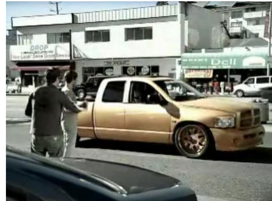
Click Poster To View "Change/Car"