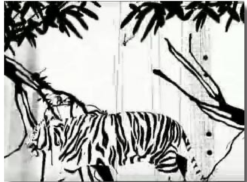
Click Poster To View "Indian Rug"