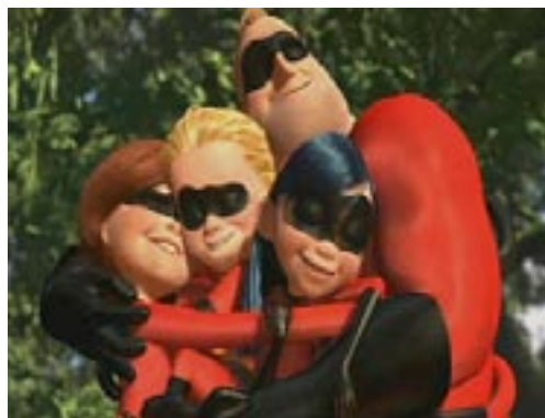
Click poster to view "The Incredibles."

Wheeler Audio, Kansas City. Jim Wheeler, mixer.