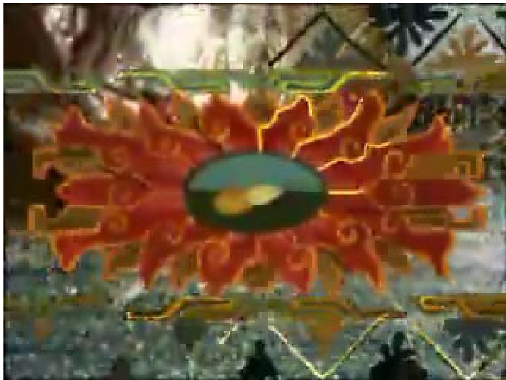
Click Poster To View "Tibetan Box"