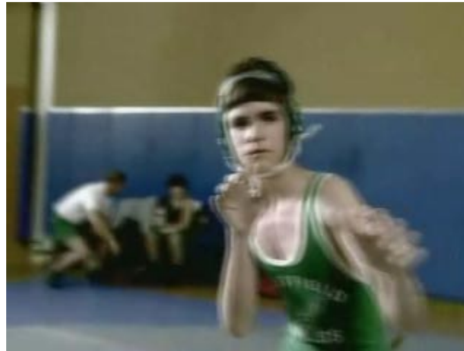
Click Poster To View "Stuck"