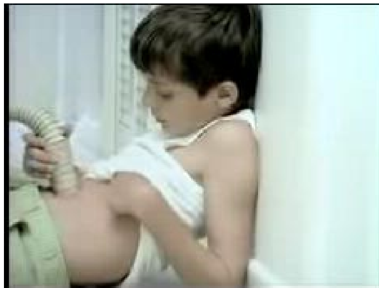
Click Poster To View "Hose"