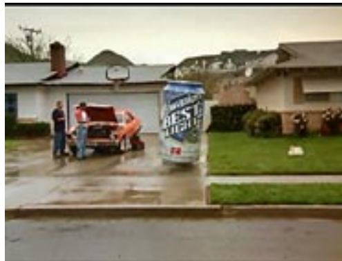
Click Poster To View "Dog"