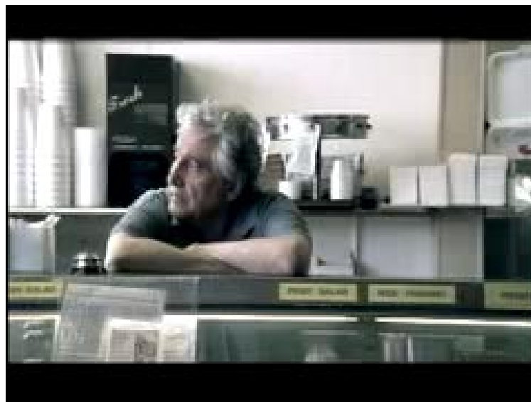
Click Poster To View "Deli"

The deli proprietor looks quizzically at the crew person, whose response is to clap down on the board as if to signal