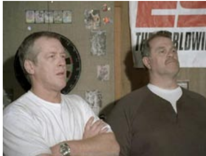
Click Poster To View "Changing"